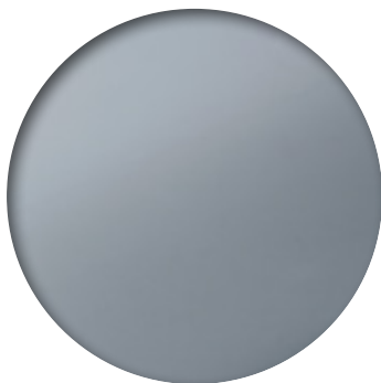
Black Securit Glass