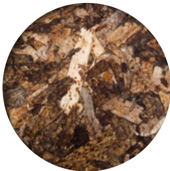
Posidonia Oceanica Sea Plant