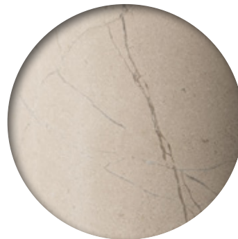
Peloponnesian Tortora Marble